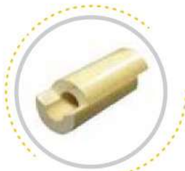
Prefabricated Polyurethane Pipe