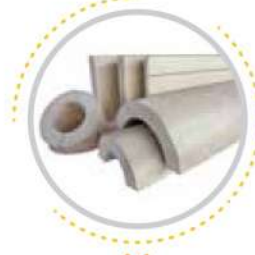
Calcium Silicate Insulation