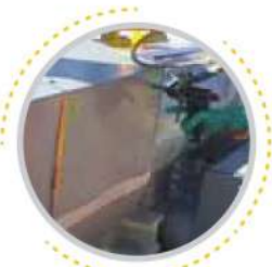
Polyurethane Injection Foam