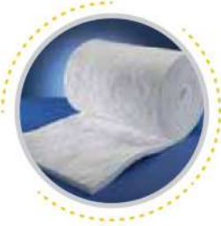
Ceramic Fiber Insulation