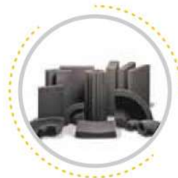
Foam Glass Insulation (Glass Foam)