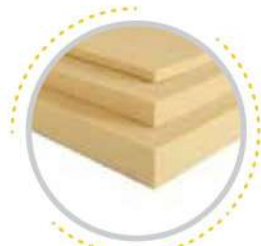
Prefabricated Polyurethane Board