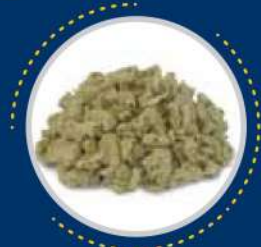
Rock Wool Bulk