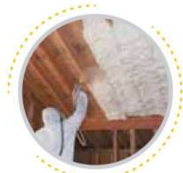
Spray Polyurethane Foam