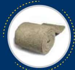
Rock Wool Blanket