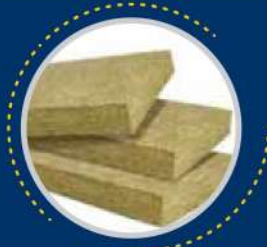
Rock Wool Board