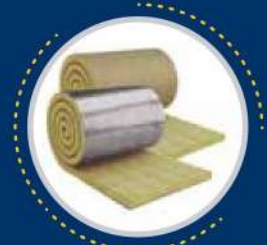
Rock Wool Matt