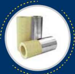
Loose Rock Wool